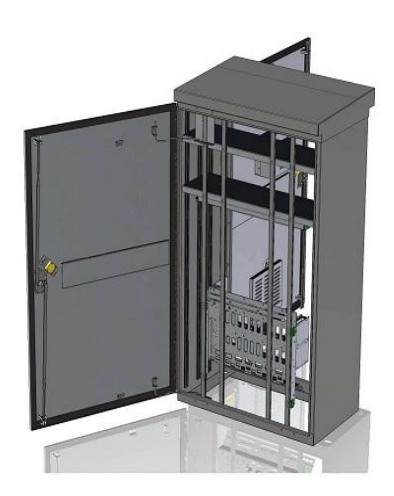
Size 7 - Dual Door (Rear View)